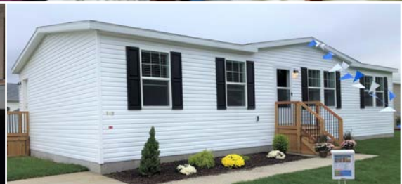
Somerset Floorplan 28' X 56'