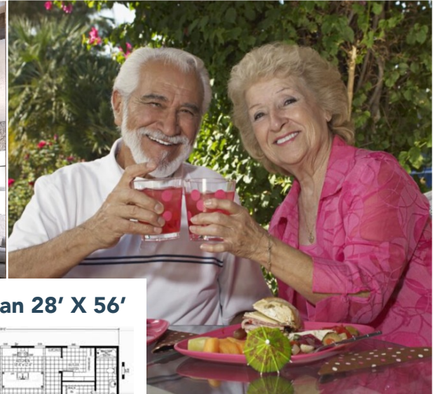
560 Floorplan 28' X 56'