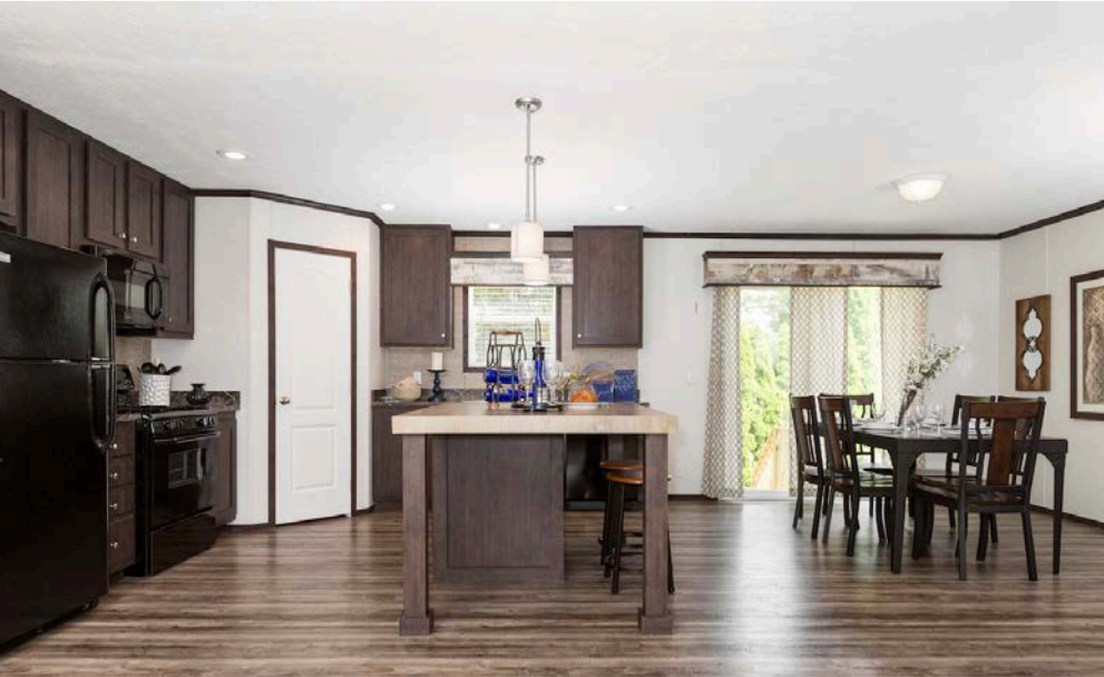
838 Floorplan 28' X 52'