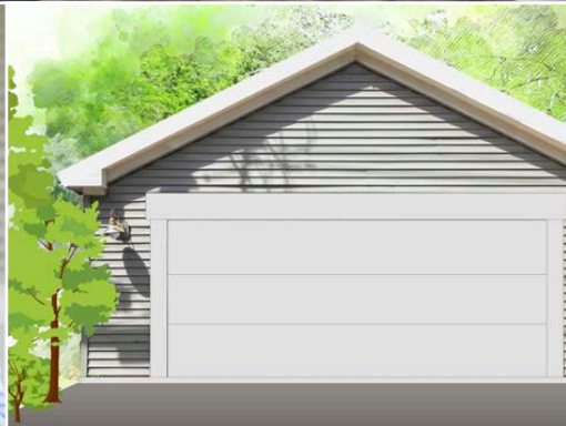
550 Floorplan 28' X 56'